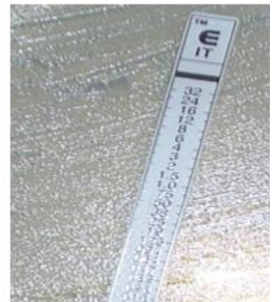
Fig 3: Itracon MIC = 0 is resist