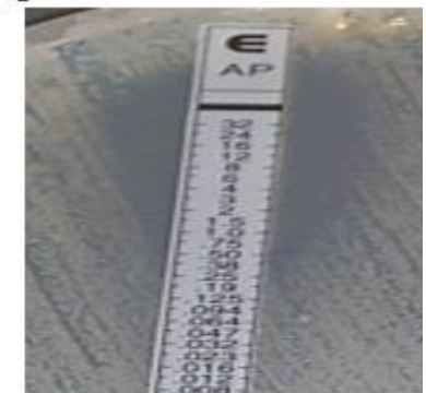
Fig 6 | AP: MIC = 2 Resistant

Included in these manuscripts are the following figures which depict representative pictures of E test results of Fluconazole, Itraconazole, and Amphotericin B showing resistance, sensitive dose dependence, and sensitive results respectively