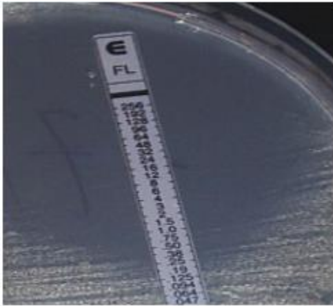
Fig 1: Fluconazole= sensitive 0.5