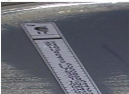
Fig 4: Itracon MIC = 0.064 sense