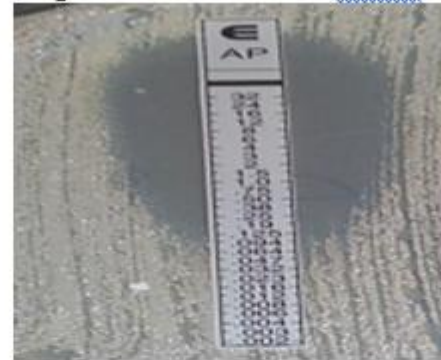
Fig 5: Amphot B MIC = 0.1 Sens