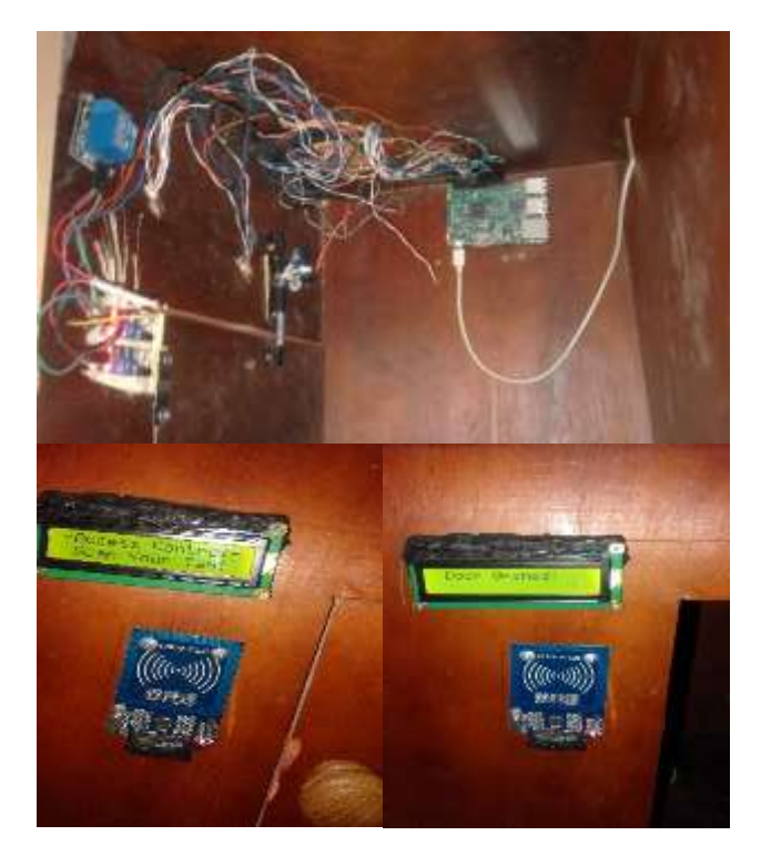
Fig4. The results of the system

the instruction was displayed on the LCD screen, it means the system is prepared to read the RFID tag. After scanning the RFID master tag, some of the RFID tags were added. One of the tags was brought to about 5cm in front of the reader, a response 'Access Granted' was displayed on the LCD and the servo motor opened the door, and the door was closed after 8 seconds. The door sensor sense the status of the door and trigger the relay switch to make open or close circuit, then the email was sent immediately to the user stating that "The door is open at current time" or "The door is closed at current time". The other cards that were not added in the system was brought to about 5cm in front of the reader, a response 'Access Denied' and was also displayed on the LCD.